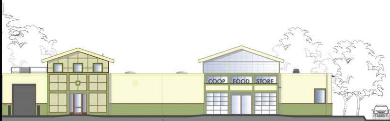
NORTH ELEVATION NOT TO SCALE

Elevations have been flattened at this point